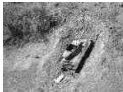
Serbian tank destroyed in Kosovo by NATO forces using DU ammunition.

WHO states, "measurements of depleted uranium at sites where depleted uranium munitions were used indicate only localized (within a few tens of meters of the impact site) contamination at the ground surfaces." 23 Similarly, a study performed by The Royal Society, the UK's national academy of science, concluded that approximately 70-80% of all DU penetrators remain buried in the soil of Iraq and the Balkans. Although "measurements of environmental contamination in Kosovo have not shown widespread contamination with DU...hot spots of contamination are present around penetrator impacts." 24 This is also likely to be a concern in Baghdad and other cities in Iraq where DU was used during the recent U.S.-led invasion.