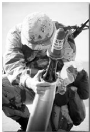
U.S. soldier using a DU shell.

932 soldiers had moderate to and after the Gulf War I.